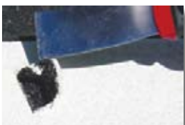
Always perform chisel test to ensure proper bond