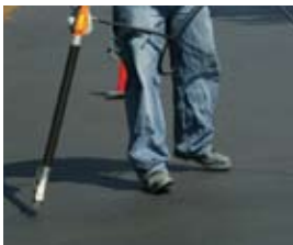
Ensure no moisture is present prior to application.