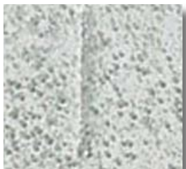
Heat material thoroughly making sure all indents are closing on the surface.